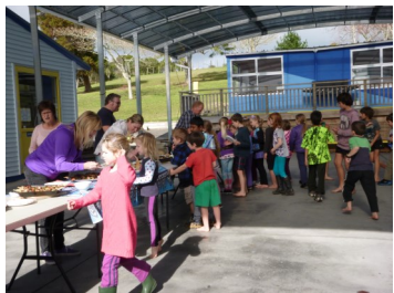
Children enjoy cooking a Turkish meal after our extensive study of this country.

Kokopu School is noted for its high academic achievements. The school is student focused and every student is encouraged to reach their full potential within a safe and secure environment. Students enjoy the learning experiences teachers provide and display a strong work ethic. The Board and Staff encourage close working relationships with parents/whanau, as this plays a major role in helping Kokopu students achieve very well.