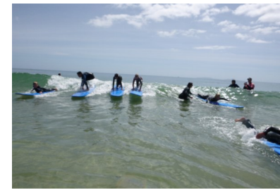
Surfing lessons at Sandy Bay.

A specialised art focus will be delivered one afternoon a week. Guitar lessons are offered by a professional guitar teacher for a reasonable charge during the year. We also encourage other outside tutors for specialised music teaching. Year 5 to 8 children have free ukulele lessons. We also have a Calf Club / Ag Day annually.